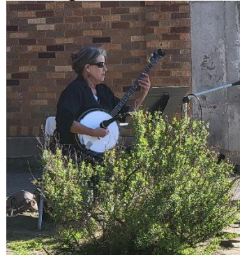
Someone with a sign and a cowbell, costumes by a runner and a bystander also with a cowbell, and some banjo music helped make the day. No, I didn't say "More..."

There was no problem with radio reception or transmission on either day, the repeaters worked fine. I didn't have to mess with my hand-held. Maybe I finally have it figured out.