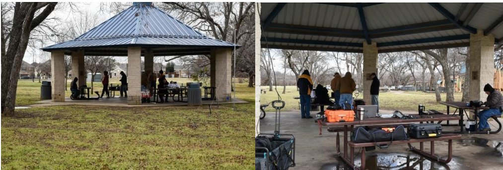
A little cool but still having fun!

In case you didn't get enough last month: