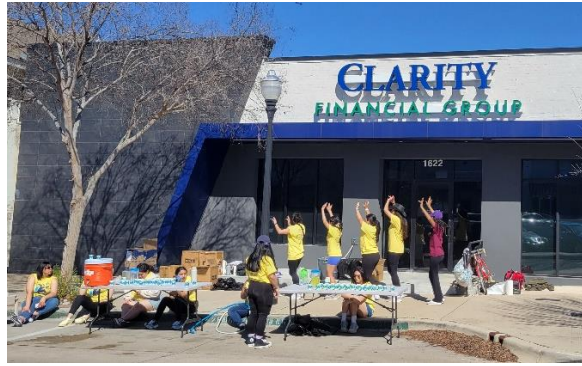
The sorority sisters got bored near the end.