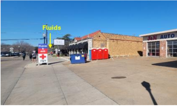
The outhouses seemed harder to notice in the dark.