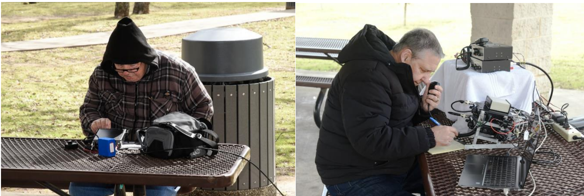
Making some contacts.